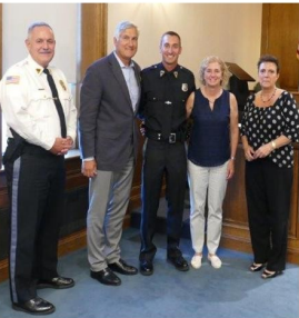
Congratulations again to both Officers.