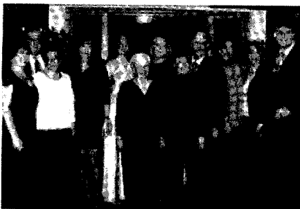
Mayor Polce swore in the Old Tappan First Aid Corps Line and Administrative Officers at their December dinner.