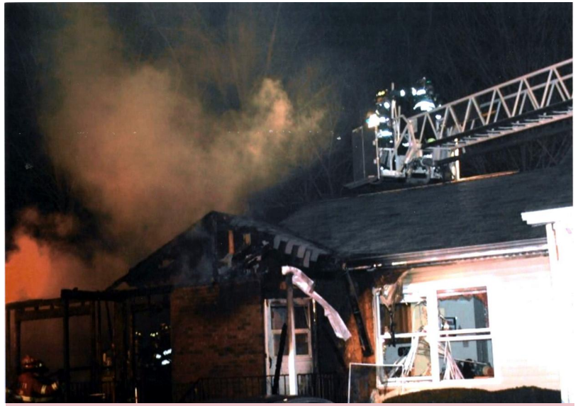
From the relative safety of Tower Ladder 63's bucket, firefighters prepare to vent the roof and give the firefighters inside the structure relief from the pent up heat, smoke, and toxic gases.

Shortly after 6:00 pm on March 5, a bitterly cold day with sub-freezing temperatures, the Old Tappan Volunteer Fire Department was called to 32 Russell Avenue, site of the Borough's Senior Citizen housing, and found one unit fully involved in fire, with extension to the dwelling next to it. Police removed a trapped occupant from the residence adjoining the original fire and brought him to safety. The heavy volume of fire and intense heat required firefighters to knock down the main body of fire in the original and the adjacent units before searches could be conducted throughout the structure. No other victims were present. Damage was confined to the two units. All other residences in the complex were undamaged and habitable at the conclusion of firefighting operations. Radiating heat from the fire damaged the automobile of one of the residents.