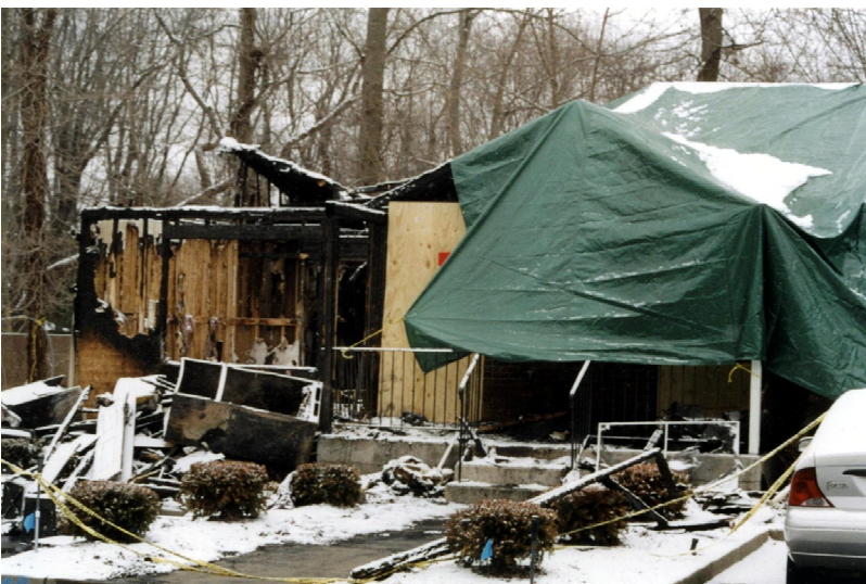
The devastating results of a fire