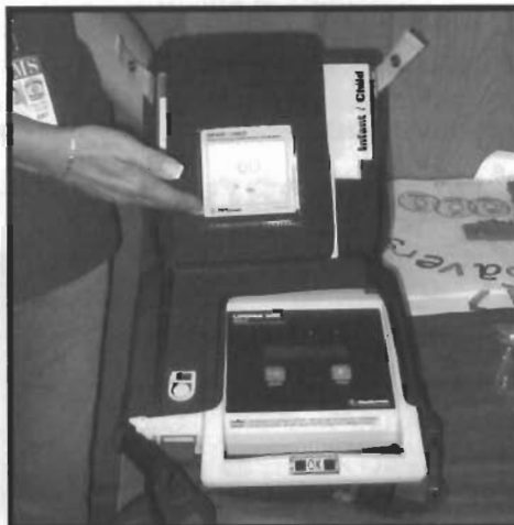
This new defibrillator can be safely used for children from the age of one year as well as adults.