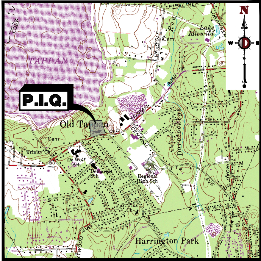
KEY MAP 1" = 2000'