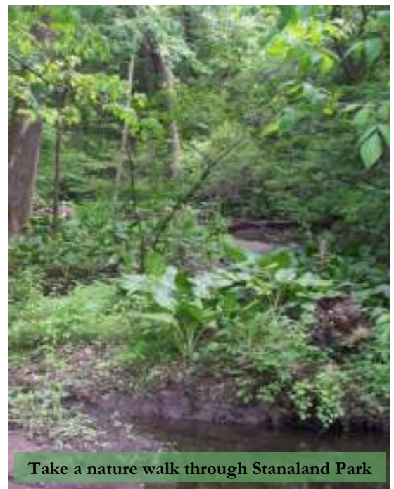
Take a nature walk through Stanaland Park

With Spring now in the air, I remind you to get outside and enjoy the outdoors. Walk along the Old Tappan reservoir or in one of our several parks. It is a special time in our special little town. Let me know how you are doing and how the Council and I can make your Old Tappan even better. We invite you to attend our meetings and witness how your elected officials manage the affairs of the borough: positively, disciplined and in a totally transparent manner. Send me an email ( mayor@oldtappan.net ) or send in your comments through the website ( www.oldtappan.net ) to any of the Borough's many departments or boards, committees, and commissions. Enjoy the season!